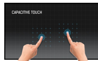
Touch technology - Capacitive

IPS displays are best known for wide viewing angles and natural, highly accurate colours. They are especially suited for colour-critical applications.